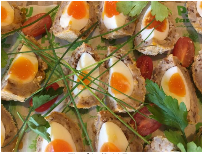
The Sheffield Egg